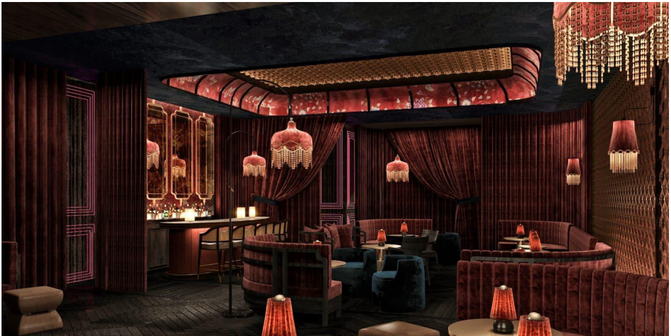
East meets west at this speakeasy bar with inviting decor, world-class service and laid-back atmosphere.