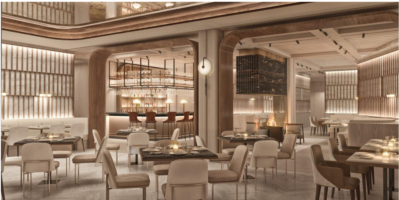
The new restaurant at Chasing Rabbits offers Mediterranean flair.

“We will play daily movies at 2:30 p.m. that are appropriate for the whole family, as well as a weekly Monday film night in our speakeasy, Moon Rabbit, geared towards guests over 21,” Knobel said.