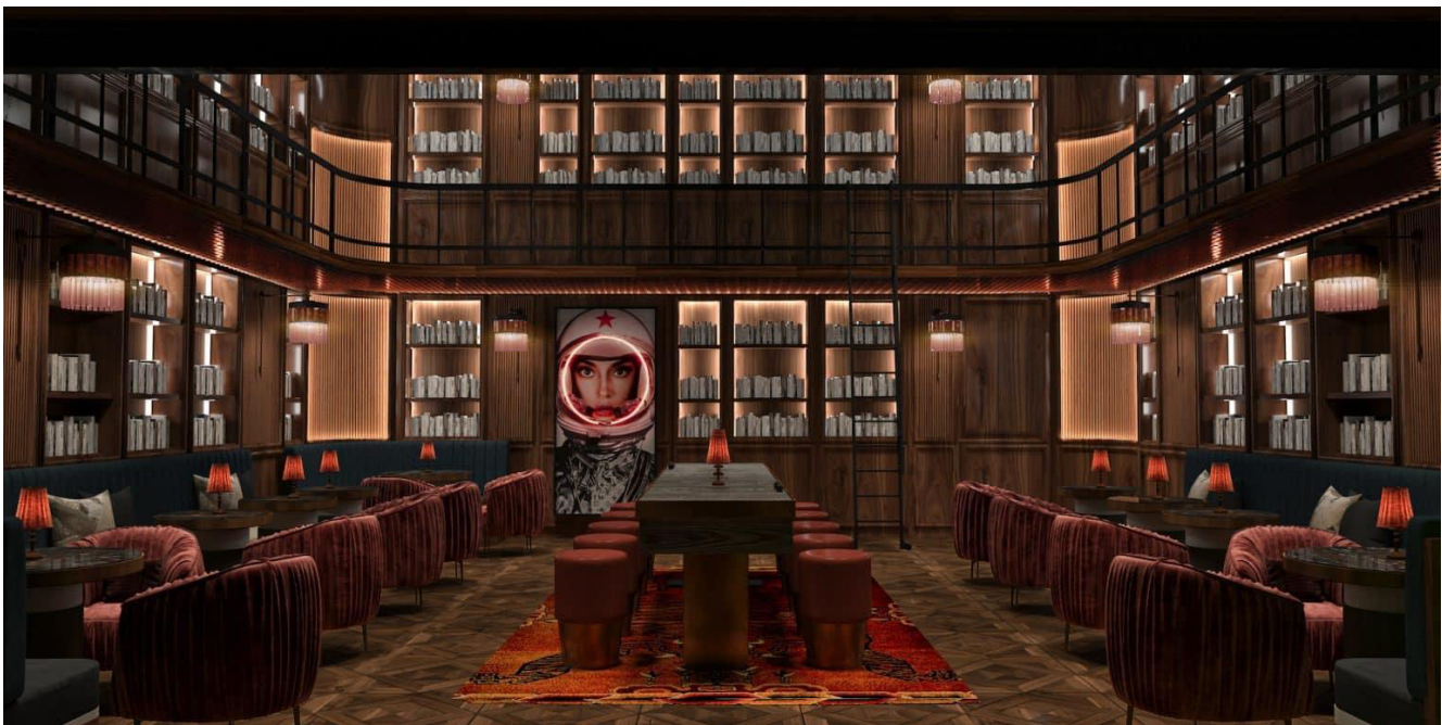
The Library features floor-to-ceiling shelves full of books surrounding an intimate space where sophisticated cocktails and dinner can be served.